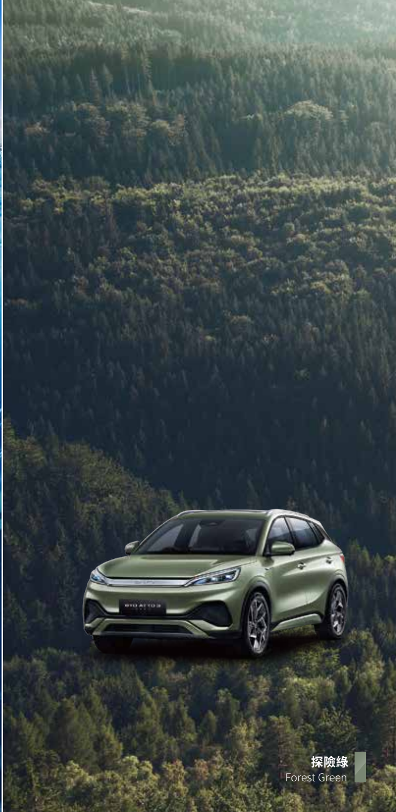
探險綠 Forest Green