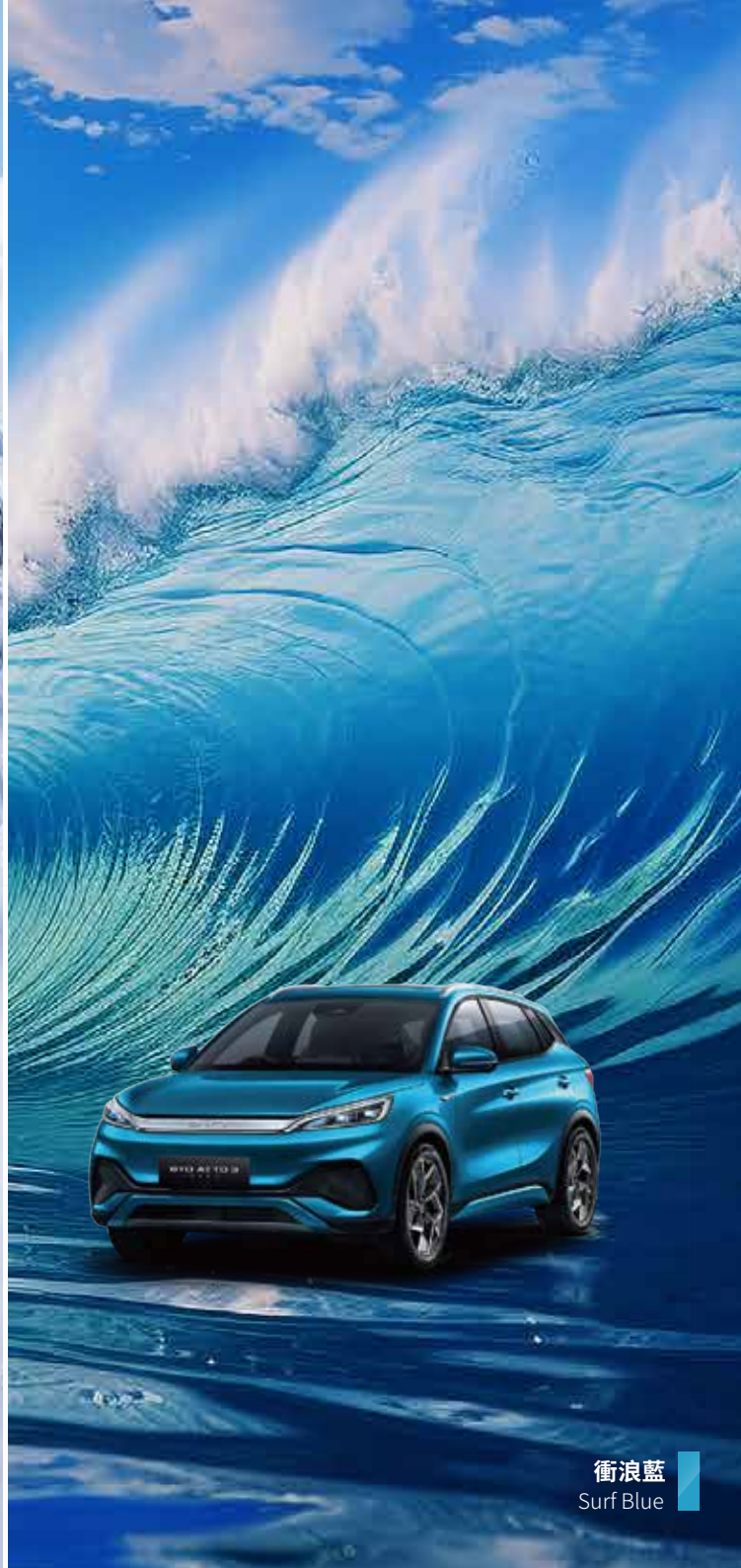
衝浪藍 Surf Blue