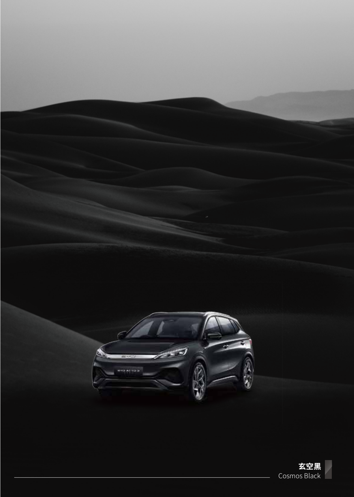
玄空黑 Cosmos Black