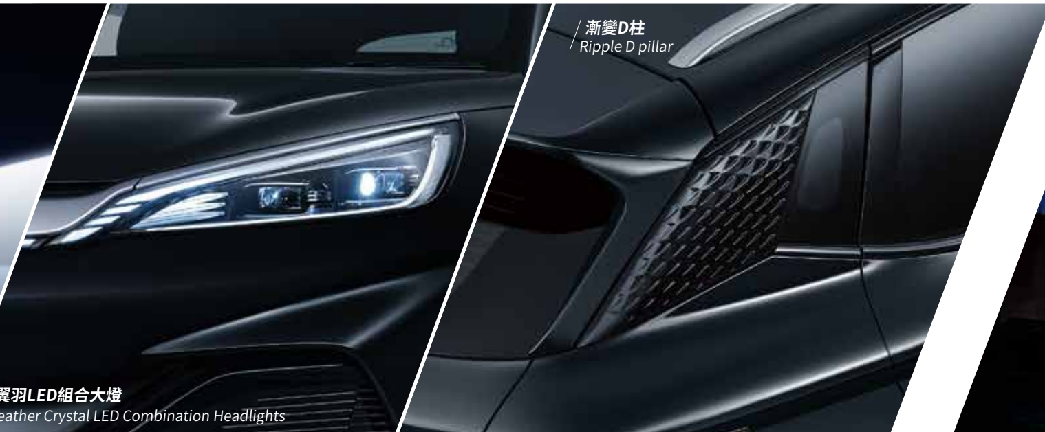
漸變D柱 Ripple D pillar