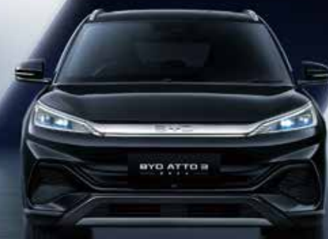
翼羽LED組合大燈 Feather Crystal LED Combination Headlights