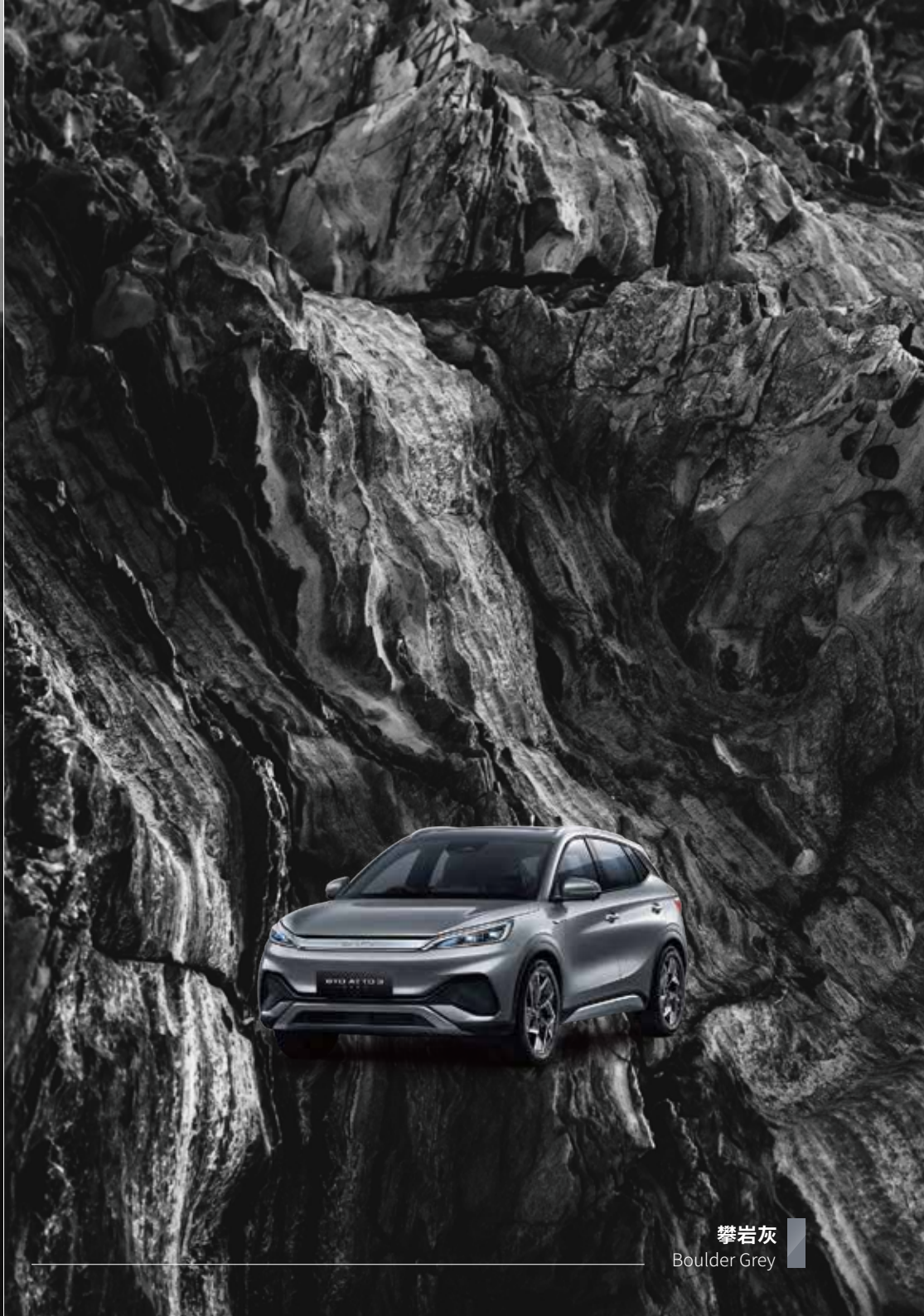
攀岩灰 Boulder Grey