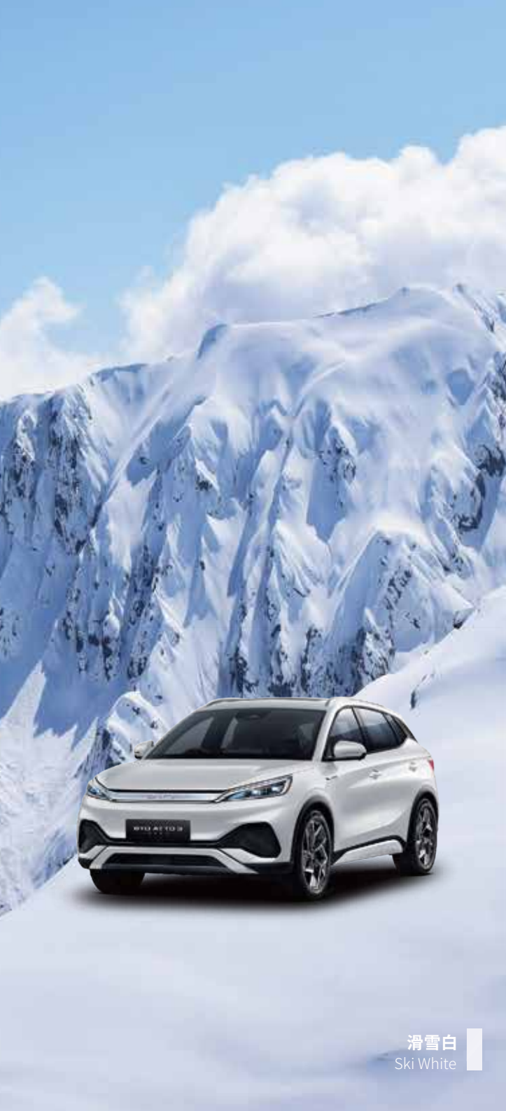
滑雪白 Ski White